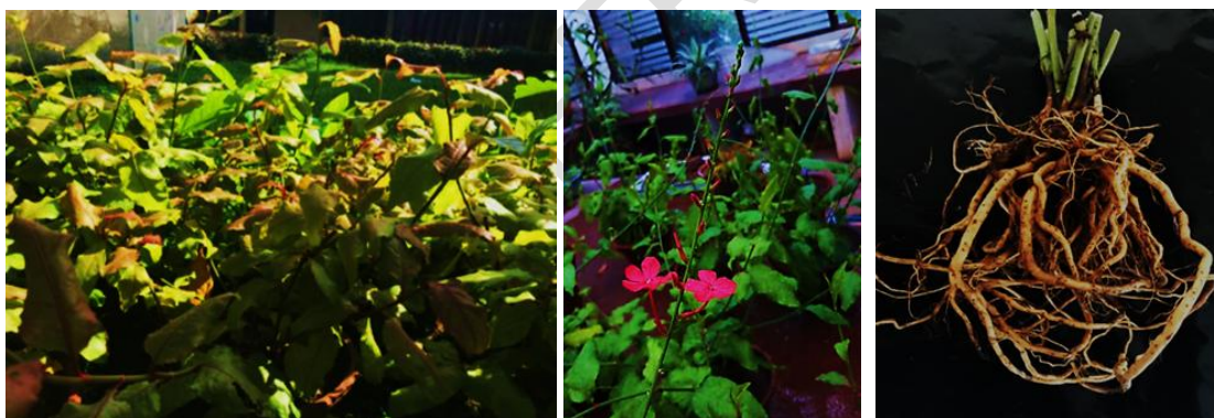
Plate 01: P. indica (a) Plants (b) Flowers (c) Tuberous roots

P. indica has wide range of pharmacological activities against many diseases. Currently plumbagin is mainly extracted from P. indica roots [8]. As plant does not produce seeds, shoot cuttings are mainly used for the vegetative propagation [9]. This plant has a slow growth and take considerably long period of time for roots to be ready for medicinal purposes [8]. P. indica rapidly decline from their natural habitat due to over exploitation for commercial uses [10]. Normally distractive harvesting is done as the root system of this plant used in preparation of traditional medicines [9]. Therefore in vitro plant propagation methods are used as an alternate strategy for sustainable conservation and propagation of P. indica [10].