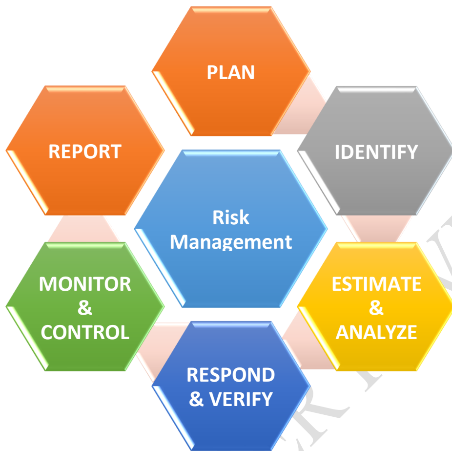
Fig 1. Framework for Risk Management of Medical Devices