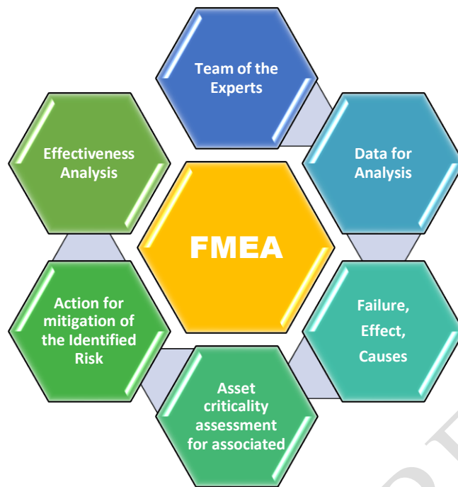
Fig 3. The process chart of FMEA process

Risk Management will cover the following stages of lifecycle for Orthopaedic Implants. Following are the identifications of the hazards and reasonably foreseeable sequences associated with the medical devices manufactured by KAULMED Pvt. Ltd. [8,11]