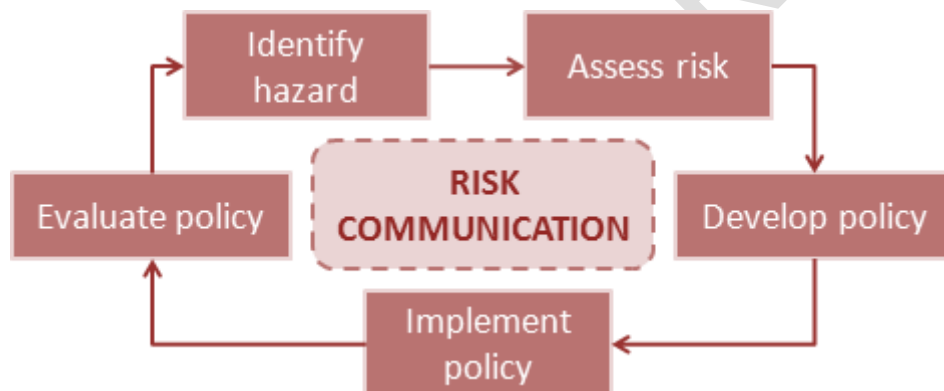
Fig.6 Risk communication process chart

There are few unknowns when it comes to routine risk problems, and those in charge of risk management are well aware of the consequences of disclosure. The confirmation that the risk is still normal and that all management agencies are well-prepared to execute the requisite activities for public safety is needed for risk coordination for this sort of risk (such as ongoing monitoring, testing, evaluation, and reporting).