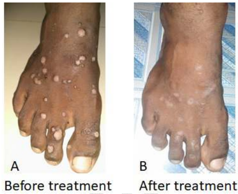
Fig. 2. Patient 2 (P2) Before treatment: Multiple warts on the right foot (A). After treatment: Cured after 8 weeks (B).