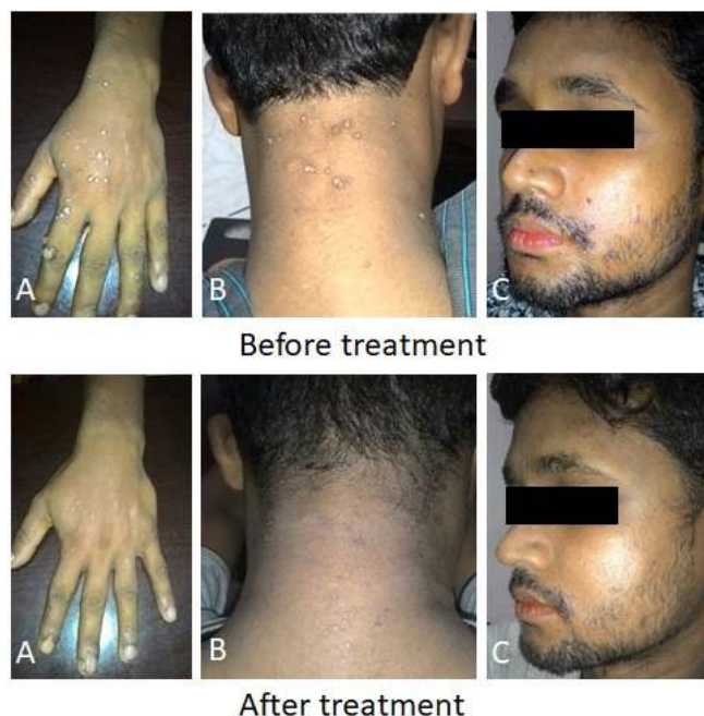
Fig. 3. Patient 3 (P3) Before treatment: Warts on the left hand (A), the neck (B), and the face (C). After treatment: Disappearance of warts from the left hand (A), the neck (B), and the face(C), within 14 weeks

The appearance of warts was rough, dry, cracked, and like cockscomb, observed in all the above patients.