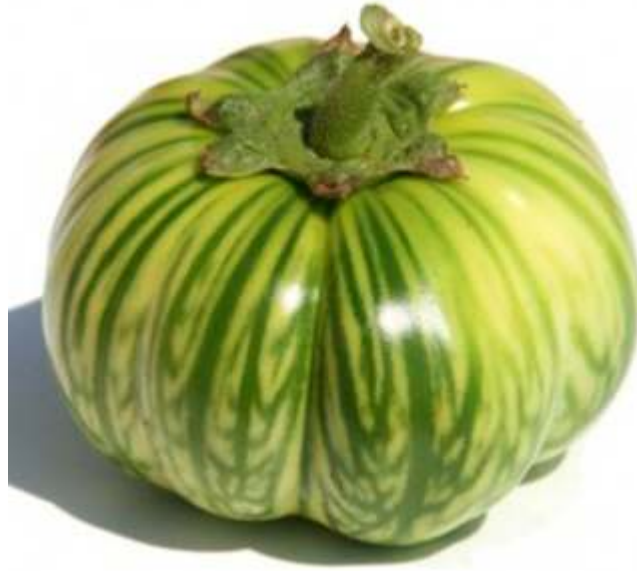
FIG.1 Solanumaethiopicum Linn fruit

Garden egg fruit can be categorized anatomically into three distinct layers namely the epicarp (also known as exocarp), which is the outermost layer; the mesocarp, which is the middle layer; and the endocarp (inner layer surrounding the seeds).