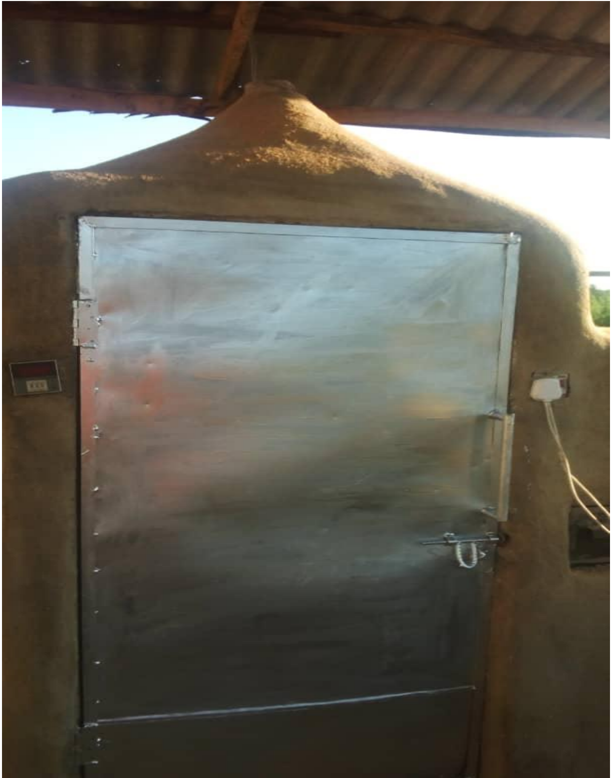
Plate 2: Electrical Fish Smoking Kiln Structure.