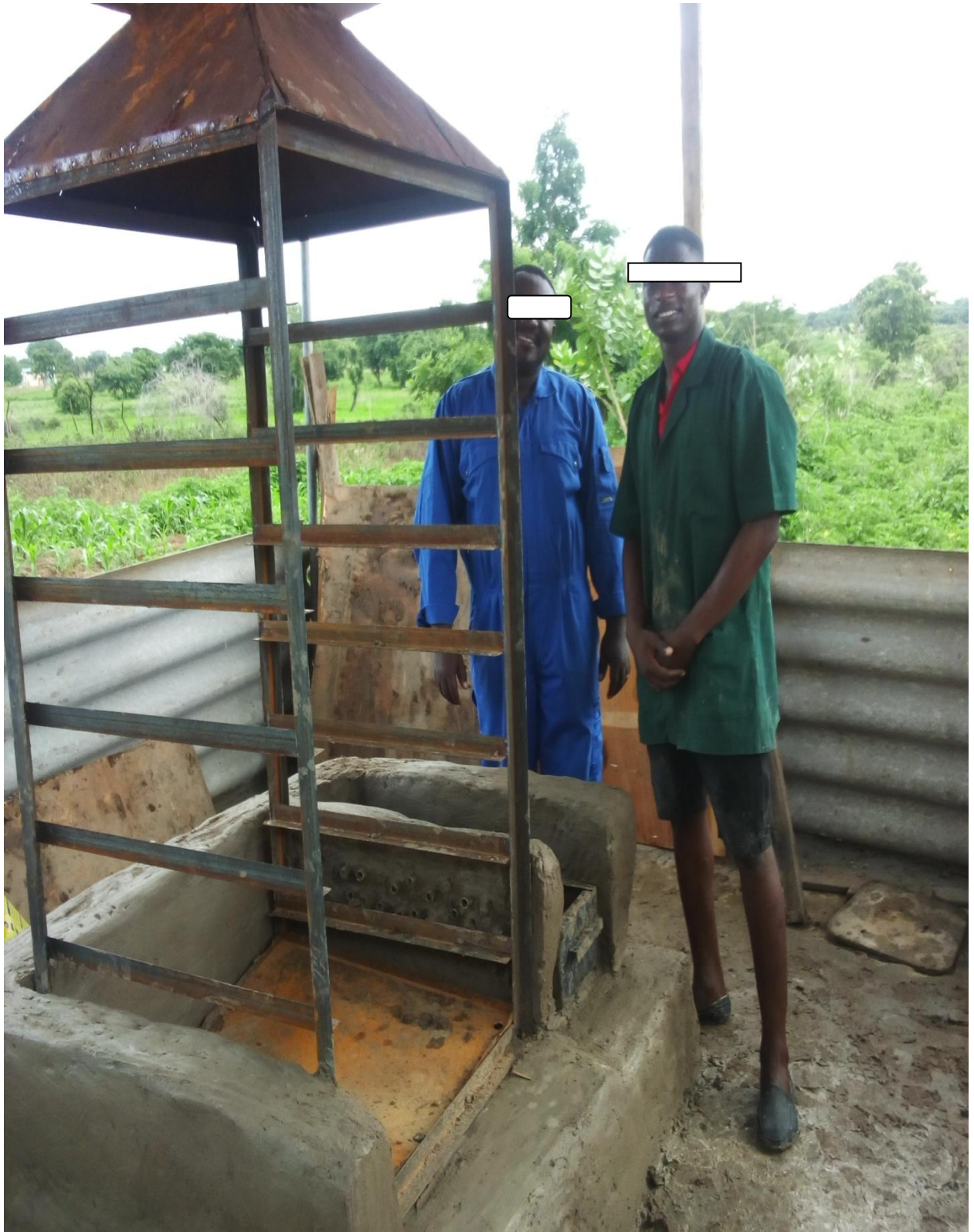
Plate 1: Kiln Wall under Construction