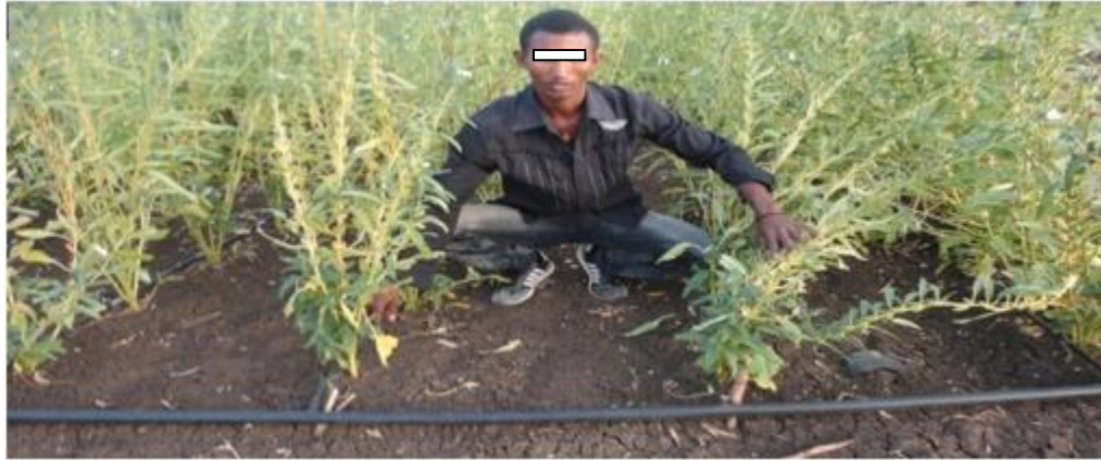
Table 1. Irrigation schedule for onion on-site evaluation of family drip irrigation