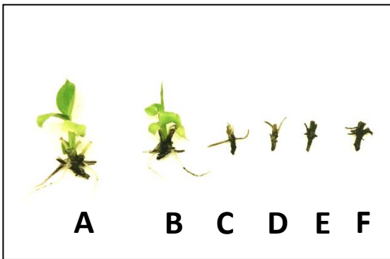
Plates 2. Banana in vitro plantlets cv. Pisang Ceylon developed after BAM-FX ® treatments: (A) MS basal, (B) MS + 0.16 \mu\text{L ml}^{-1} BAM-FX ® , (C) MS + 0.32 \mu\text{L ml}^{-1} BAM-FX ® , (D) MS + 0.64 \mu\text{L ml}^{-1} BAM-FX ® , (E) MS + 1.28 \mu\text{L ml}^{-1} BAM-FX ® , (F) MS + 2.56 \mu\text{L ml}^{-1} BAM-FX ® .

Shoots from Grand Naine (GN) showed an average of 3 shoots per explant, while shoots from Pisang Ceylon (PC) formed an average of 4.25 shoots per explant, with an average shoot length of 2.08 cm for both cultivars (Table 2).