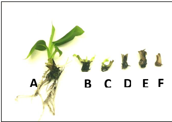
Plate 1. Banana in vitro plantlets cv. Grand Naine developed after BAM-FX ® treatments: (A) MS basal, (B) MS + 0.16 \mu\text{L ml}^{-1} BAM-FX ® , (C) MS + 0.32 \mu\text{L ml}^{-1} BAM-FX ® , (D) MS + 0.64 \mu\text{L ml}^{-1} BAM-FX ® , (E) MS + 1.28 \mu\text{L ml}^{-1} BAM-FX ® , (F) MS + 2.56 \mu\text{L ml}^{-1} BAM-FX ® .