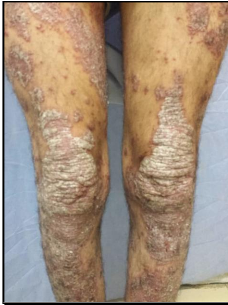
Figure 1: A 50-year old male patient presented with chronic plaque psoriasis on both lower extremities