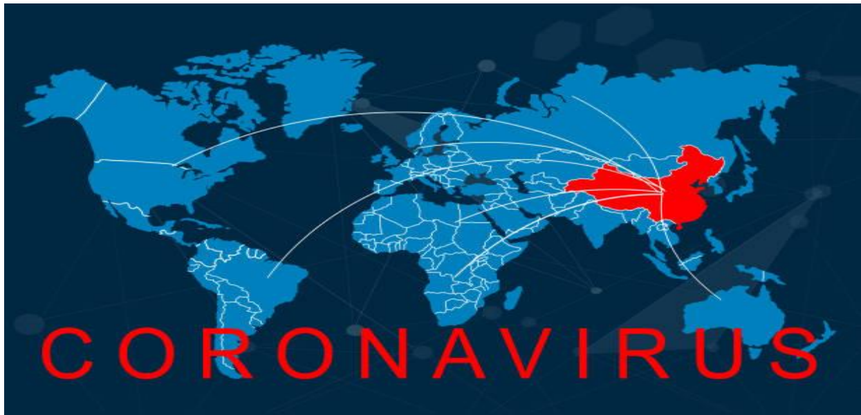
Figure - 2

According to WHO on 11 th March 2020 the number of cases of COVID-19 outside China has increased 13-fold and the number of affected countries has tripled. Thousands more patients are fighting for their lives in hospitals. WHO has assessed the outbreak as alarming and that COVID-19 can be characterized as a pandemic. By that time there were more than 1,18,000 cases in 114 countries and 4,291 people have lost their lives 10 ( Figure -2 ).