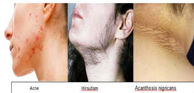
Fig .2. Dermatological signs of PCOS.

acanthosisnigricans. The difference in the proportion