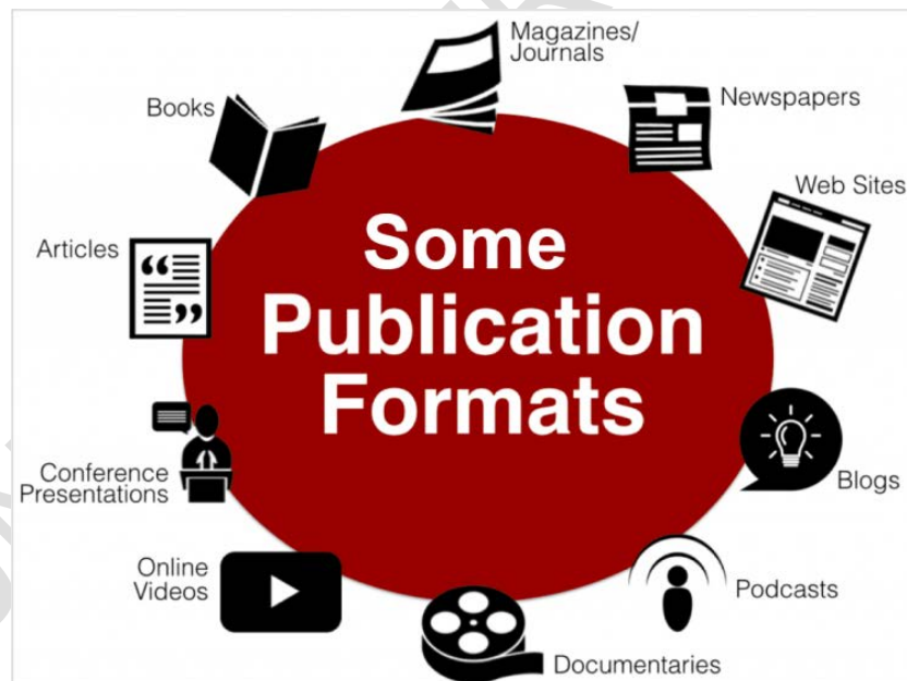
Fig. 4. Various forms of materials that make up the electronic portfolio [7]

Therefore, the electronic teaching portfolio represents a collection of data that highlights the work of the teacher, the teaching progress registered by him, as well as his professional development. These data include, most often and not limited to, lesson plans, examples of assessment activities (formative, summative, formal, informal), maps (including conceptual), tables, graphs, photographs, stories related to teaching and assessment, certificates of participation in various professional development activities, reflections on teaching, etc. Besides, in the case of the physical education teacher ("forced" by circumstances to limit his activity in the gym or outdoors), for example, we can discuss the addition of multimedia elements to the conduct of physical education classes or training.