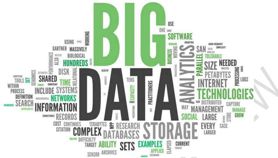
Fig. 2. A mind-map example for the massive transmission of information related to the Big Data concept [7]

more efficiently and that he can transpose, sometimes even transform, into a person who monitors, analyzes, and evaluates the individual learning process.