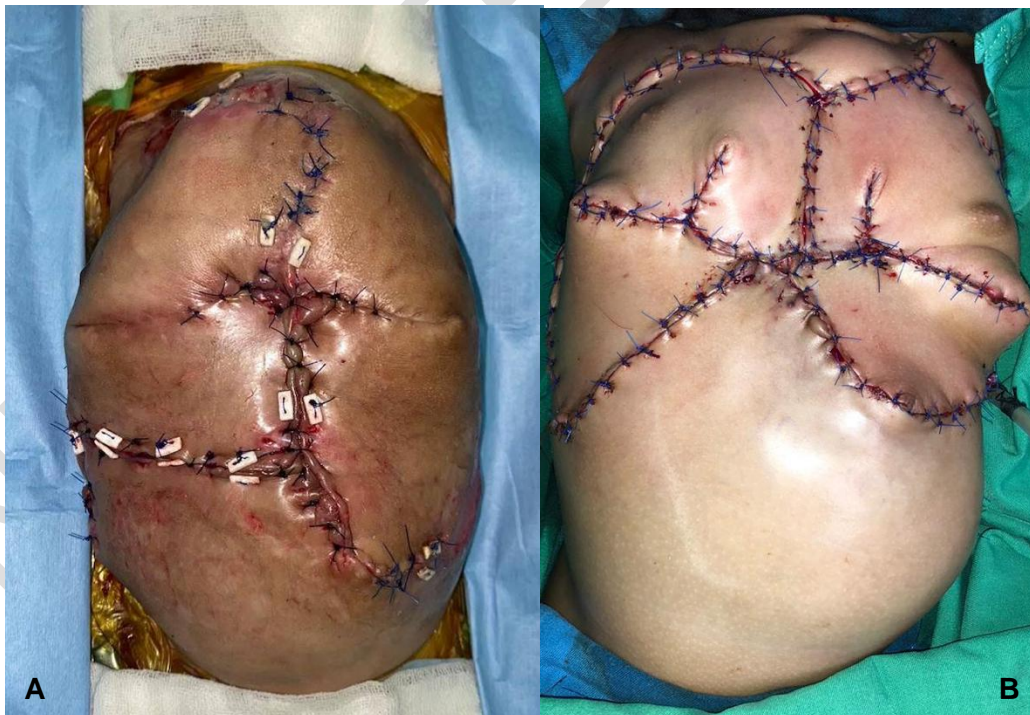
Figure 5. Defect at the anterior thorax and abdomen was closed using keystone flap by plastic surgeon in Baby A and Baby B

In Baby A, closure of the thoracic and abdominal cavities were initially delayed and these gradually closed using a local flap and split-thickness skin graft (STSG) in the donor area within three months. After the surgery, both babies showed improvement in their respiratory functions, which were marked by their successful weaning from the ventilator in 1 month in Baby A and two months in Baby B. Baby A was discharged two months after surgery, and Baby B was discharged three months after surgery.