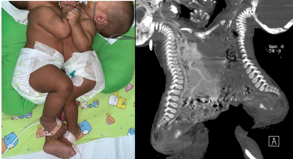
Figure 1. Two babies shown thoraco-omphalopagus twins, conjoined from the sternum with a surface area of 15 x 9 cm

The separation operation was performed when the babies were 18 months old, two months after their SARS-CoV-2 infection had resolved. The 15-hour procedure was performed by a multidisciplinary team consisting of 2 cardiothoracic surgeons, three paediatric surgeons, and four plastic surgeons that allowed two separate teams to be created once the twins were separated. Total blood loss was approximately 200 cc, and there were no intraoperative complications.