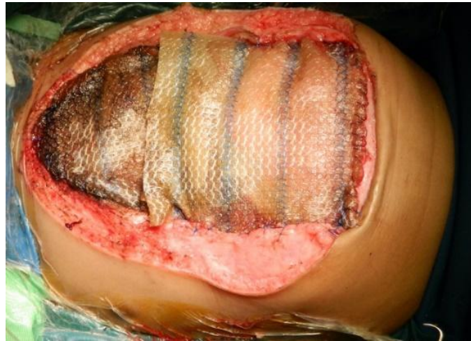
Figure 5. The picture shown a surgical mesh to close the thoracic and abdominal cavity in Baby B

A surgical mesh 20.3 cm x 30.5 cm was used to close the thoracic cavity and abdomen (Fig. 5). The liver of Baby B was approximated to unite the raw surfaces by a pediatric surgeon. Finally, the anterior thorax and abdomen defect were closed using a local flap by the plastic surgeon. Both babies were stable after the procedure and were transferred to the pediatric intensive care unit and they tolerated the ICU ventilation well.