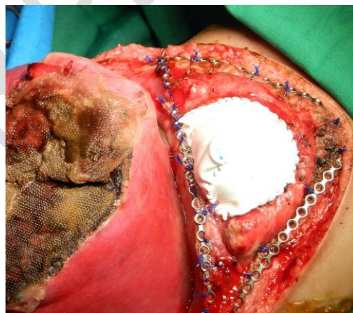
Figure 4. Reconstruction of the pericardium using patch for Baby A. Before this step, the reconstruction of the chest wall was done using metal plate.

In Baby B, the sternum was incomplete on the left side. The ribs (costae) on the left side were not connected with the sternum and the left pleura was perforated . The pericardium and diaphragm were intact. The left side of the sternum was reconstructed and fixated using a metal plate with interrupted sutures using 2/0 polypropylene. The diaphragm was fixated to the plate connecting both hemithorax with interrupted sutures using 4/0 polypropylene.