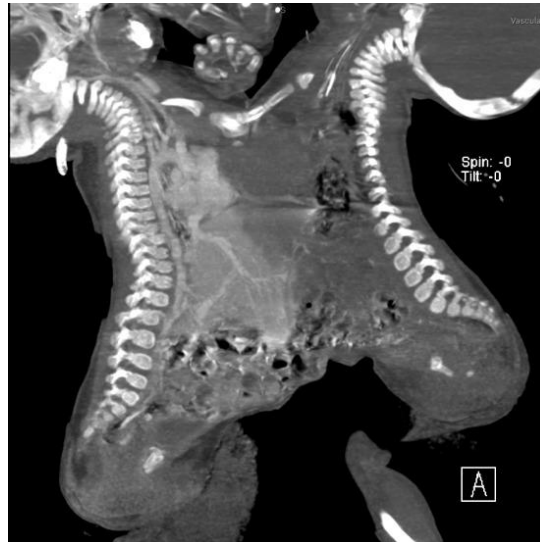
Figure 1. CT angiography of the two babies shown thoraco-omphalopagus twins, conjoined from the sternum with a surface area of 15 x 9 cm

The separation operation was performed when the babies were 18 months old, two months after their SARS-CoV-2 infection had resolved. The 15-hour procedure was performed by a multidisciplinary team consisting of 2 cardiothoracic surgeons, three paediatric surgeons, and four plastic surgeons that allowed two separate teams to be created once the twins were separated. Total blood loss was approximately 200 cc, and there were no intraoperative complications.