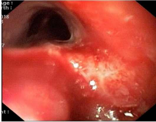
Figure 3: Esophagoscopy image with fistula in the gastric tube