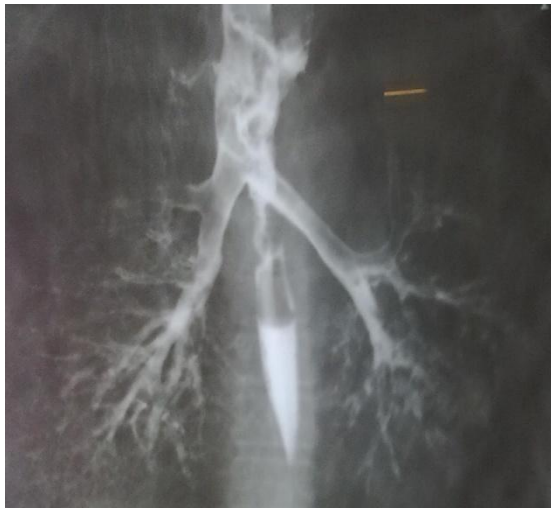
Figure 2: Bronchoscopy with fistula over the membranous portion