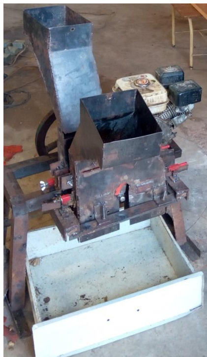
Fig. 2. Operating the dual compartment ginger slicing machine

Fresh ginger was purchased from local market in Kafanchan Local Government Area of Kaduna State. Equal weights of 500 gram each of the two varieties (Tafin Giwa and Yatsun Biri) were used for the experiment. The ginger rhizome was fed through the hopper and slides down to the respective slicing units (spring and cushion compartments). The sliced were collected in a container through the outlet just below the slicing chambers. The collected ginger was separated and weighed to determine the slicing efficiency and percent broken and bruises. The speed of impeller was varied into five levels (250, 300, 350, 400 and 450 rpm). The experiment procedures were repeated three times. The pictorial view of the dual compartment ginger slicing machine in operation is shown in Figure 2.