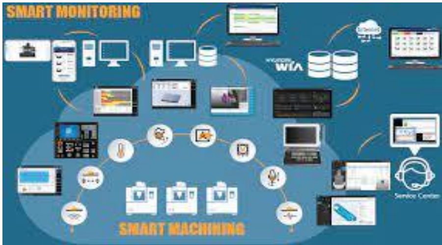
Fig. 1. Smart monitoring system [37]