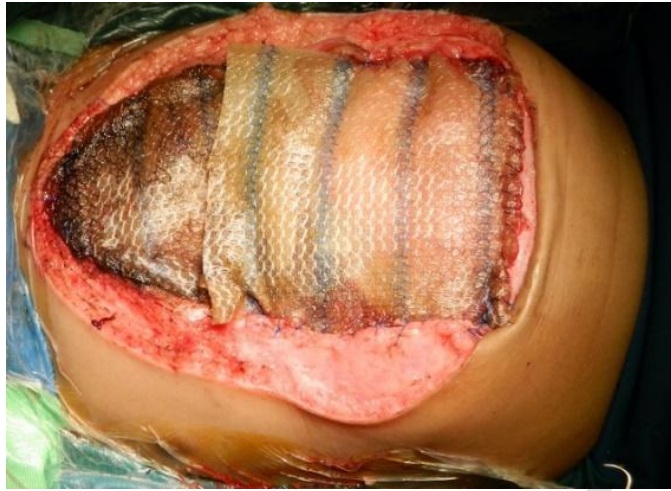
Figure 4. Surgical mesh to close the thoracic and abdominal cavity

abdomen defect were closed using a local flap by the plastic surgeon. Both babies were stable after the procedure and were transferred to the pediatric intensive care unit and they tolerated the ICU ventilation well.