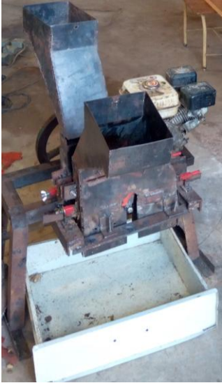
Fig. 2. Operating the dual compartment ginger slicing machine

were collected in a container through the outlet just below the slicing chambers. The collected ginger was separated and weighed to determine the slicing efficiency and percent broken and bruises. The speed of impeller was varied into five levels (250, 300, 350, 400 and 450 rpm). The experiment procedures were repeated into three times. The pictorial view of the dual compartment ginger slicing machine in operation is shown in Figure 2.