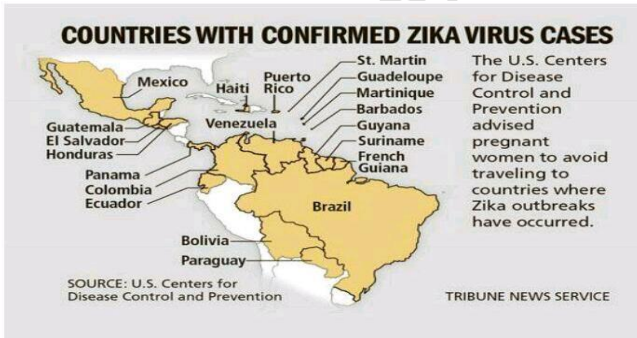
Fig 1: Pictorial representation of countries with cases of Zika virus [21].