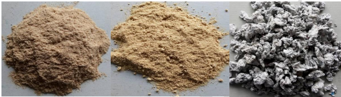
Figure 1. Dry forms of (a) Untreated wood dust (b) treated wood dust (c) waste newspaper pulp

newspapers were reduced into tiny pieces with the aid of an electrical paper shredder (Rexel V125) and the pieces were immersed in warm water in a plastic bucket. After 18 hours, they were removed from the water and pounded into pulp. The treated wood dust, untreated wood dust and waste newspaper pulp were made to dry completely in air. Figure 1 shows the forms of the materials prior to their use for fabrication of test samples.