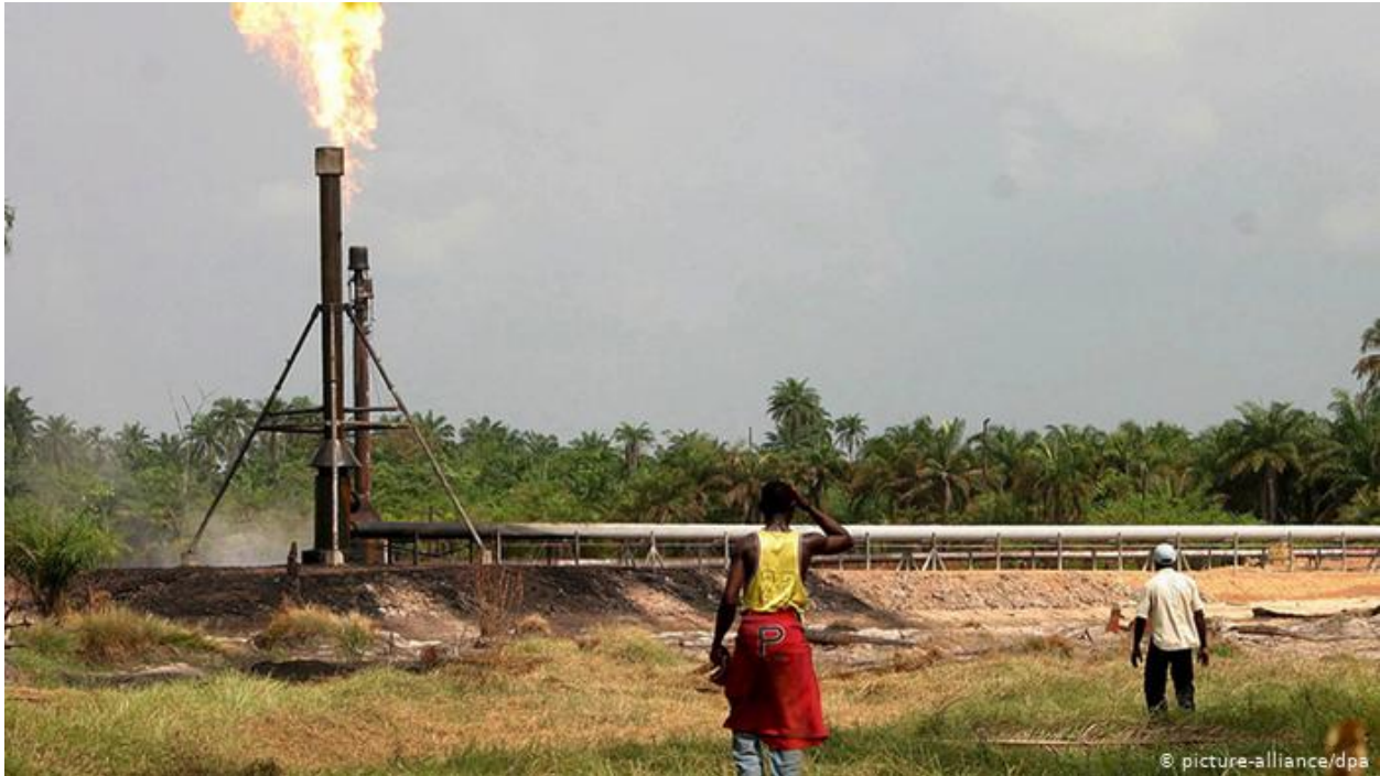
Figure. 1: A gas flaring site.