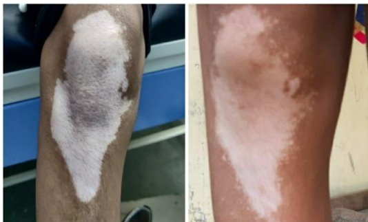
Before treatment After treatment