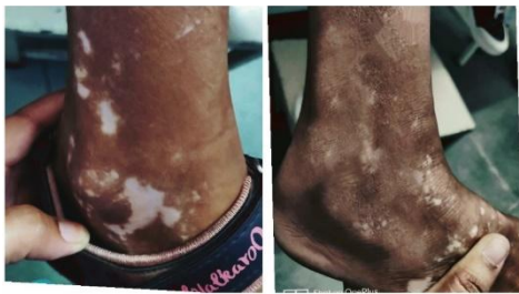
Before treatment After treatment