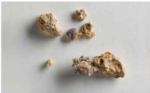
Fig. 1. Kidney stones

Urinary stones are solid masses composed of a collection of small crystals (Figure 1) which are formed and present in the urinary tract, due to the agglomeration of some components in the urine under certain physicochemical conditions. Urinary stone disease has a great influence on human health and is a disease with a high likelihood of recurrence (or recurrent at a rate of more than 10% within a year).