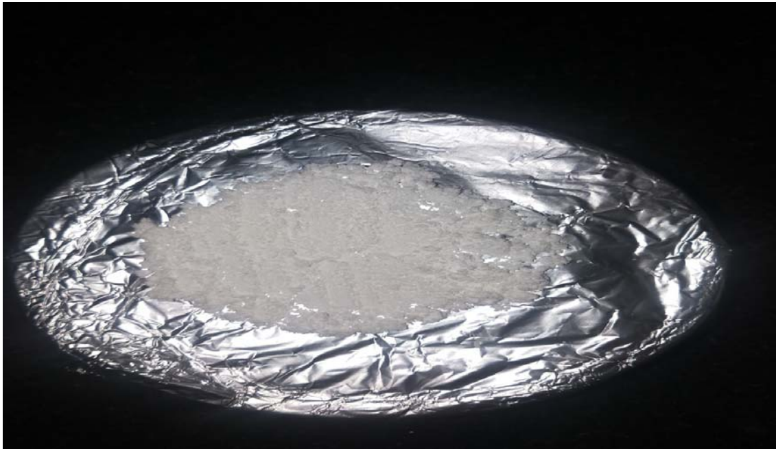
Fig 4. Calcium phosphate crystals