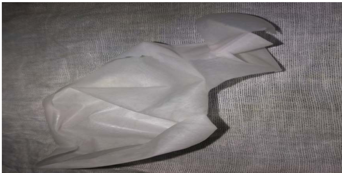
Fig 3. Prepared Semipermeable membrane from egg