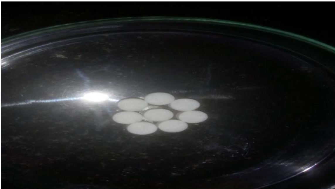
Fig 5. Calcium phosphate tablets