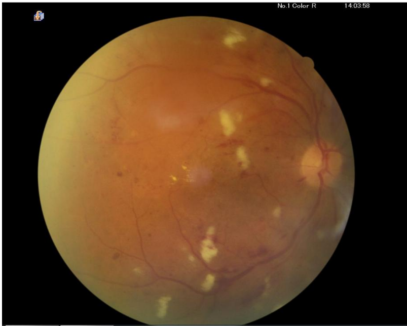
Figure 2 :Fundoscopy (right eye)Multiple cotton-wool spots and intraretinal hemorrhages