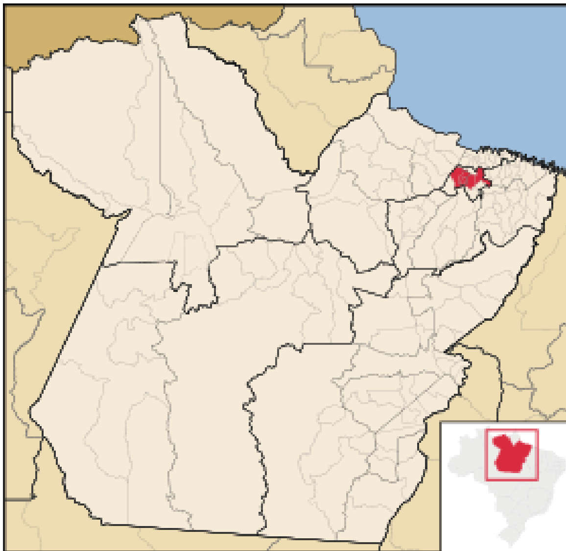
Figure 1 – Metropolitan region of Belém, Pará State, Brazil.