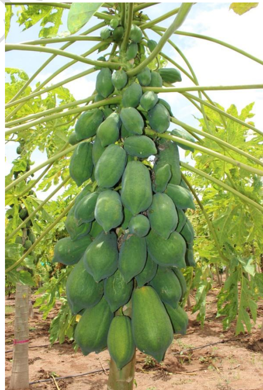
Fruit column of PRSV tolerant plant