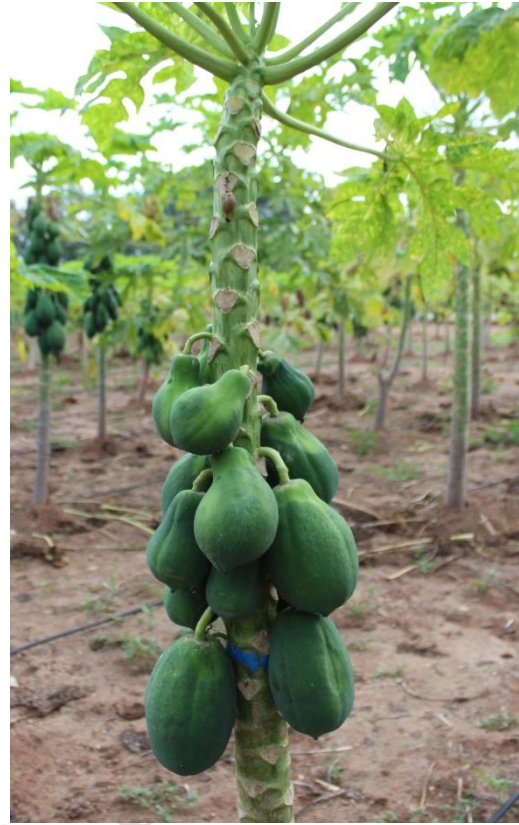
Fruit column of PRSV susceptible plant