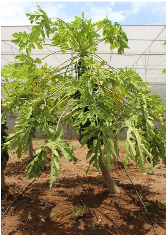
PRSV tolerant plant