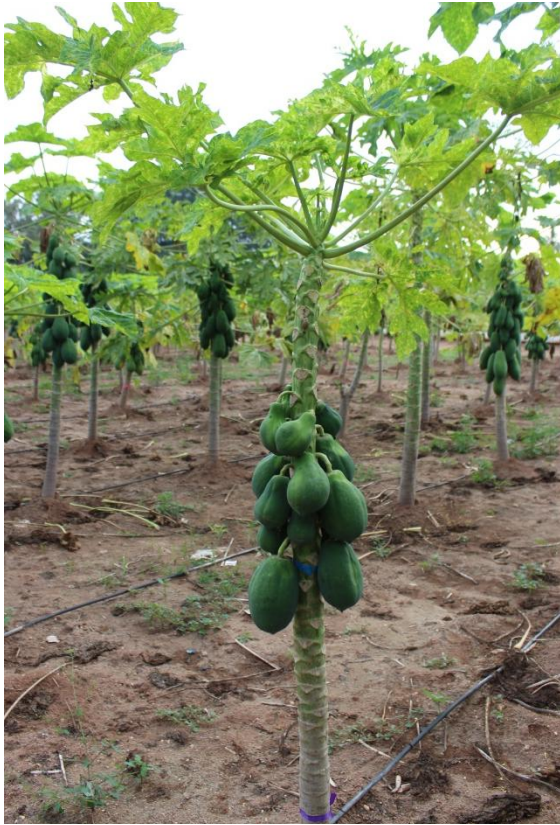
PRSV susceptible plant