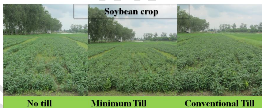
Fig. 1. Established soybean crop under different treatments

Pairwise comparison among different tillage operation for particular year ( p < 0.05 )