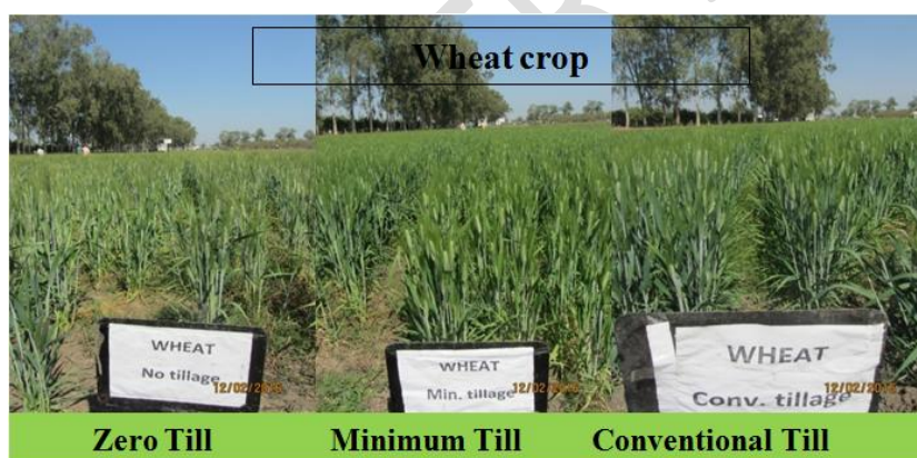
Fig. 3. Established wheat crop under different treatments

Pairwise comparison among different tillage operation for particular year (p<0.05)