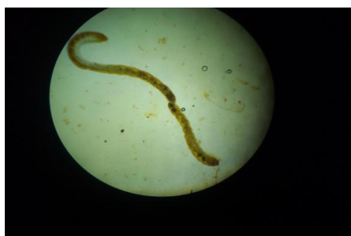
Plate 1: Showing the image of Meloidogyne javanica