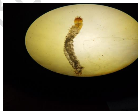
Plate 2: Showing the image of Pratylenchus crenati