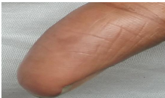
FIGURE 3: MAGNIFYING GLASS IMAGE OF THE LEFT THUMB OF A 21-YEAR OLD FEMALE WITH ADERMATOGLYPHIA.

DERMATOGLYPHICS IS NOT LIMITED TO FINGERPRINTS ALONE AS EPIDERMAL RIDGE PATTERNS CAN ALSO BE SEEN ON THE PALMS, TOES AND SOLES. PALMAR PRINT CONFIGURATIONS INCLUDE THENAR AREA, HYPOTHENAR AREA, INTERDIGITAL AREA, PALMAR CREASES, A-B RIDGE COUNT AND THE ATD ANGLE. IN ANALYZING FINGER AND PALMAR PRINTS, OTHER PATTERNS OF IMPORTANCE INCLUDE THE TOTAL FINGER RIDGE COUNT, THE ABSOLUTE RIDGE COUNT, THE POSITION OF THE AXIAL TRIRADII AND THE TOTAL NUMBER OF PALMAR TRIRADII[18]–[20] THESE PATTERNS ARE ALTERED IN VARIOUS GENETIC AND NON-GENETIC CONDITIONS.