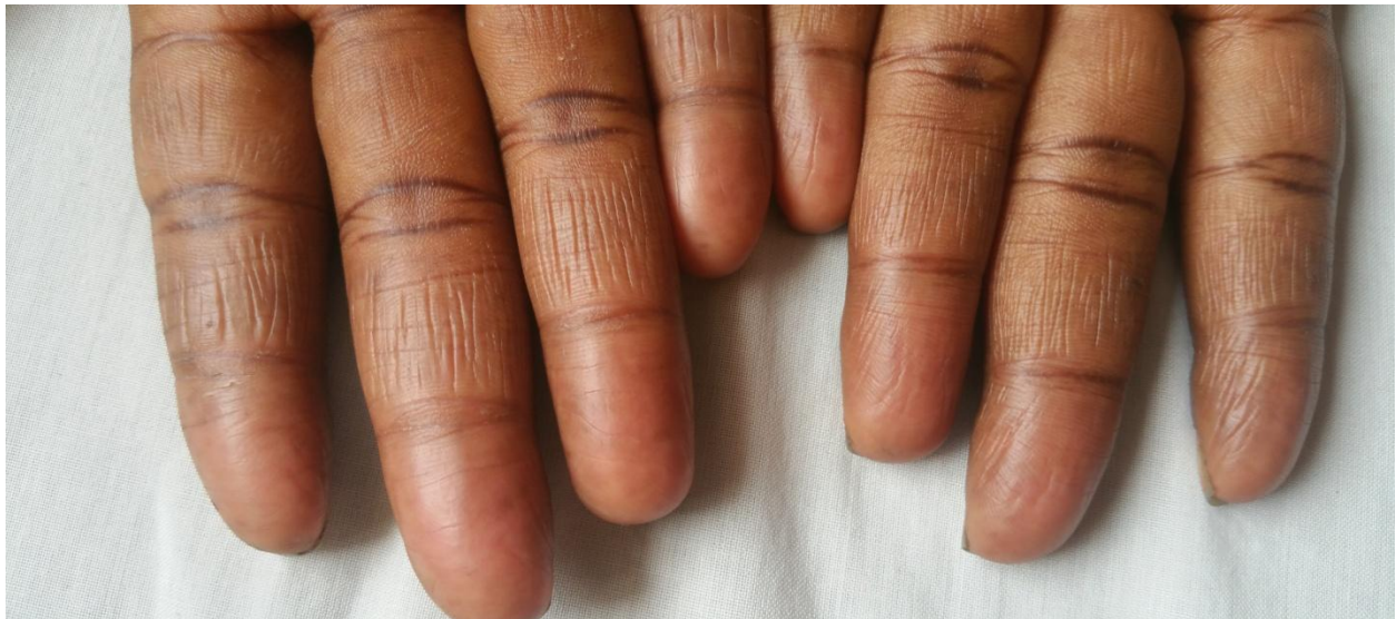
FIGURE 1: ISOLATED CONGENITAL ADERMATOGLYPHIA IN A 21-YEAR-OLD FEMALE UNDERGRADUATE PATIENT SHOWING FINGERS OF BOTH HANDS.

AT THE DERMATOLOGY UNIT OF THE UNIVERSITY OF PORT-HARCOURT TEACHING HOSPITAL, RIVERS STATE, NIGERIA, THERE HAS BEEN THREE RECORDED CASES OF ADERMATOGLYPHIA IN THE PAST FIVE(5) YEARS [PERSONAL COMMUNICATION] . THE MOST RECENT BEING A 21 YEAR FEMALE UNDERGRADUATE WHO HAD INABILITY OF FINGERPRINTS TO BE CAPTURED DURING BIOMETRIC SCREENING BY JOINT ADMISSIONS AND MATRICULATION BOARD, BANK VERIFICATION NUMBER AND NATIONAL IDENTITY CARD REGISTRATION AT DIFFERENT TIMES. SHE ALSO FOUND IT DIFFICULT TO USE THE FINGERPRINT APPLICATION AS A MEANS OF SECURING HER ANDROID PHONE.