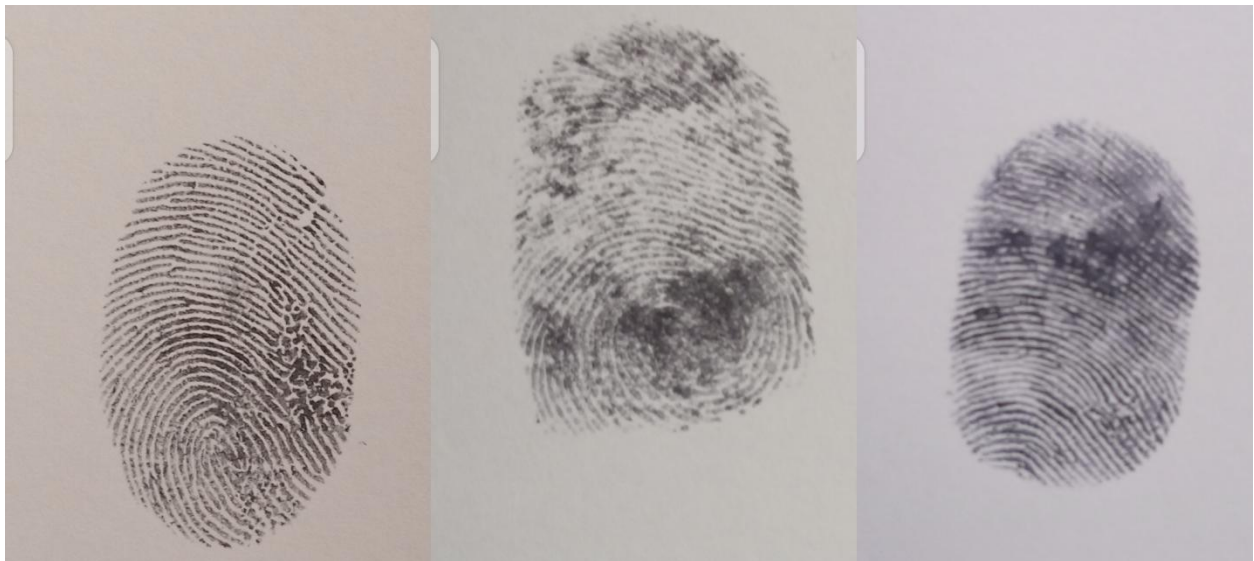
FIGURE 4: INKPAD PRINT OF DIFFERENT FINGERPRINT PATTERNS: LOOP, WHORL AND ARCH.