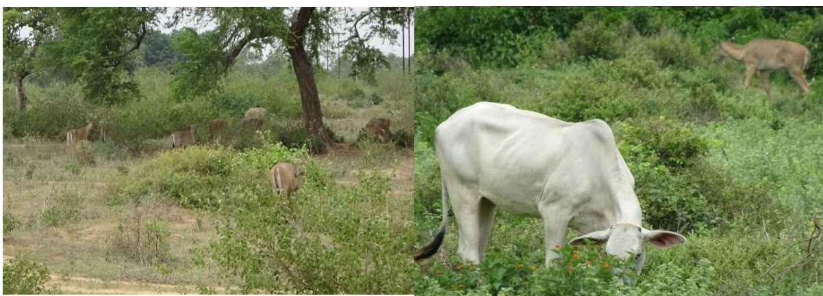
c. Nilgai grazing in HCBF, Dumraond. Nilgai grazing with domestic animal