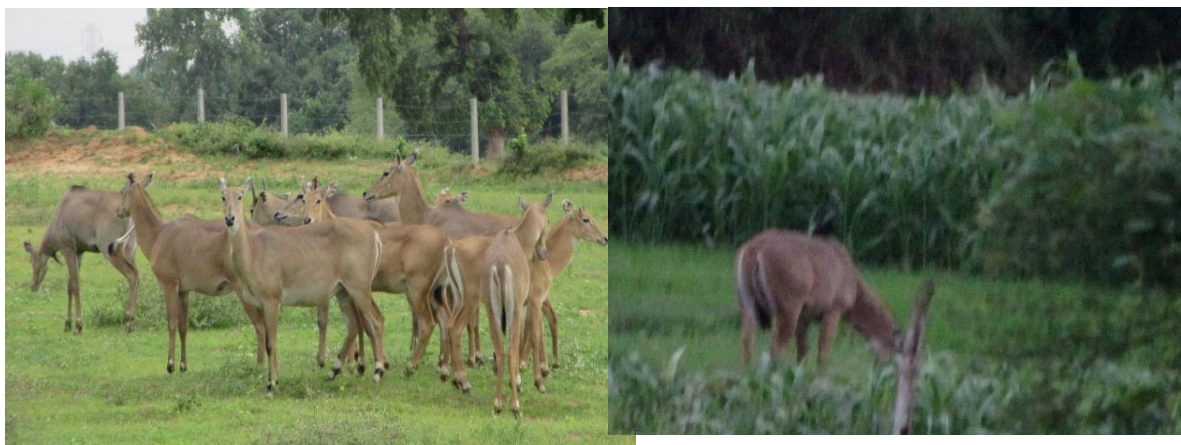
a. Juveniles Nilgai in urban areas b. Veal Nilgai grazing cultivated grass

different nature and levels of risks faced in the habitats. [28] reported behaviour of wild animal is probably the first to have been modified during domestication. In the changing scenario of demographic and ecological niche regarding present stress situation, its ( Nilgai ) behavior has also been changed and it started moving for food near human habitation during dusk period and feed along the night and returning come back early morning to the dwelling same space [23].