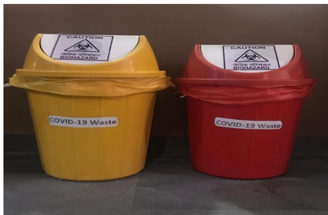
Figure 2: Red and Yellow bins in Hospitals for COVID-19 Biomedical Waste.

tubes, plastic cryovials, pipette tips as per BMW Rules, 2016 and to be collected in red bags (Figure 2).