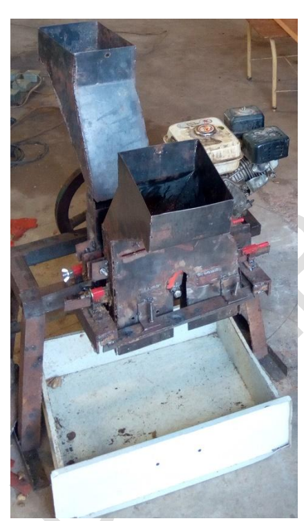
Fig. 2. Operating the dual compartment ginger slicing machine

Fresh ginger was purchased from local market in Kafanchan Local Government Area of Kaduna State. Equal weights of 500 gram each of the two varieties (Tafin Giwa and Yatsun Biri) were used for the experiment. The ginger rhizome was fed through the hopper and slides down to the respective slicing units (spring and cushion compartments). The sliced were collected in a container through the outlet just below the slicing chambers. The collected ginger was separated and weighed to determine the slicing efficiency and percent broken and bruises. The speed of impeller was varied into five levels (250, 300, 350, 400 and 450 rpm). The experiment procedures were repeated three times. The pictorial view of the dual compartment ginger slicing machine in operation is shown in Figure 2.