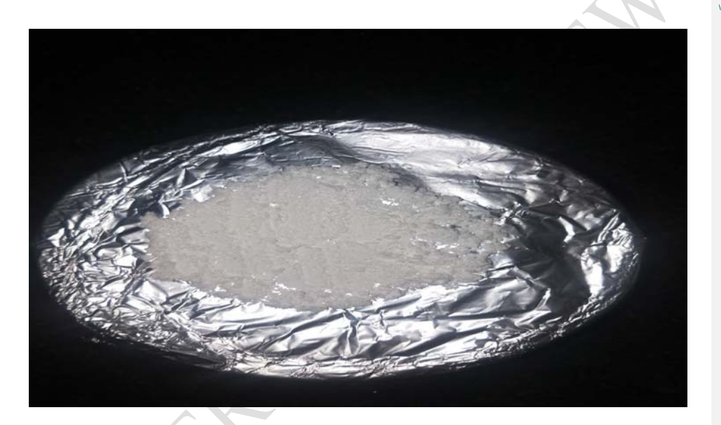
Fig 4. Calcium phosphate crystals

Then the synthesized calcium phosphate stone were punched to tablets (Figure 5) and these tablets were considered as stones in the study.