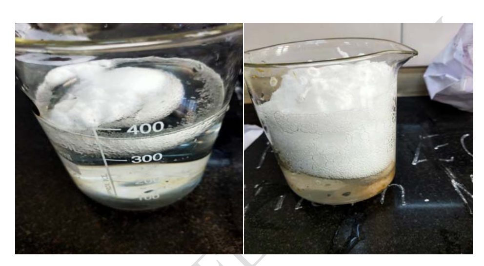
Fig 2 (a) & (b). Process of Decalcification of egg

Comment [145]: Source display is wrong. Should be shown by number.