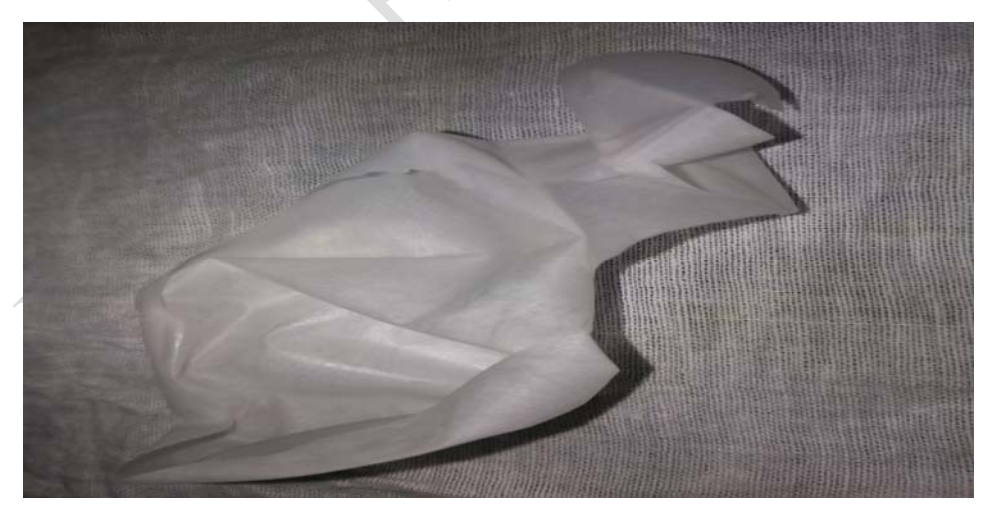
Fig 3. Prepared Semipermeable membrane from egg