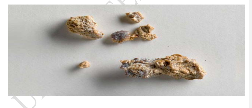
Figure 1. Kidney stones

Urinary stones are solid masses composed of a collection of small crystals (Figure 1) which are formed and present in the urinary tract, due to the agglomeration of some components in the urine under certain physicochemical conditions. Urinary stone disease has a great influence on human health and is a disease with a high likelihood of recurrence (or recurrent at a rate of more than 10% within a year).