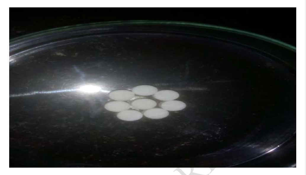
Fig 5. Calcium phosphate tablets