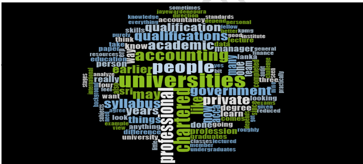
Figure 4: Respondent 3

He also mentioned that the current Accounting Education system where it does not has any trend to move forward. “My personal view is the accounting profession is going to be a dead profession sometime later, because with the automation you need not do anything. With the ERP you can do everything. Like earlier, there were people to analyze the data, provide reports and now everything is automated. The Accounting Profession may not have a proper future. You need to have so many other skills along with the Accounting Qualifications. It may be IT specialty, knowledge on law or something else”.