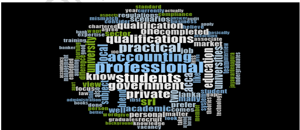
Figure 6: Respondent 5

He also stated he is not satisfied with the current Accounting Education system, “If I give a straightforward answer it’s disappointing. At the moment there is a mismatch. There is less concern for practical training. The practical training the students are getting should have to be increased. Both private and government universities have to go in line with the technology. They have to teach students by giving priority to technology. My personal view, the world Compliance has to be embedded in the Accounting Education.”