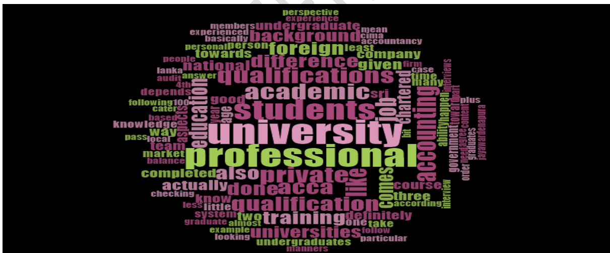
Figure 5: Respondent 4

When comes to select a candidate from Academic and Professional Qualifications, her preference is more towards the Professional Qualification. “Even though the person has done a degree we look for a candidate who has done at least one or two stages in Professional Qualification. I know academics will not help to do a job. You need to have a professional background. It does not mean Academic Qualifications are not worth for a good job. But then only it will be balanced. She truly needed to change the Academic Education given by the government universities. Because it does not match with labour market hence the practical training is not given for students in the 4 th year. “When it comes to the 4 th year the government university students have wasted almost 24 years in their life in university education without any training in the job market. Therefore, it is important to give practical training for them as well”.