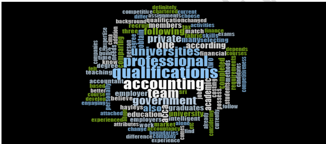
Figure 2: Respondent 1

Further, she expressed that “Definitely it should be matched with Accounting Education and the job market needs but it does not, and teaching methods should be changed according to the technology and also according to the global requirements.