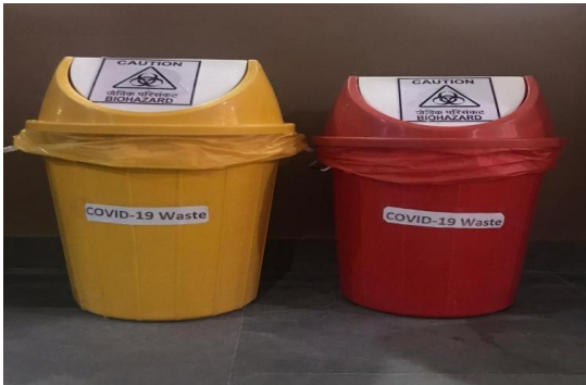
Figure 2: Red and Yellow bins in Hospitals for COVID-19 Biomedical Waste.

Control Boards (SPCBs). Pre-treat viral transport media, plastic vials, vacutainers, Eppendorf tubes, plastic cryovials, pipette tips as per BMWM Rules, 2016 and to be collected in red bags (Figure 2).