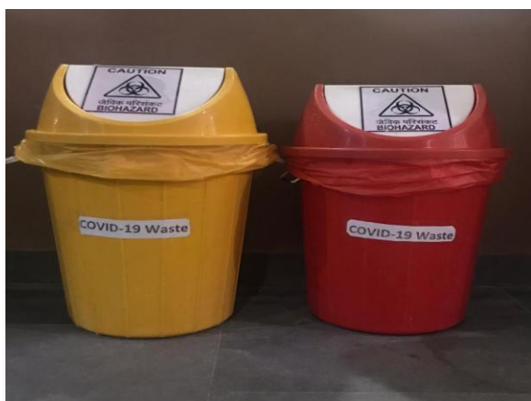
Figure 2: Red and Yellow bins in Hospitals for COVID-19 Biomedical Waste.

(iii) The quarantine facilities and during home care for suspected COVID-19 patients, the guidelines noted that even though a low quantity of biomedical waste is expected to be generated, they still need to follow strict steps to ensure safe handling and disposal of waste.