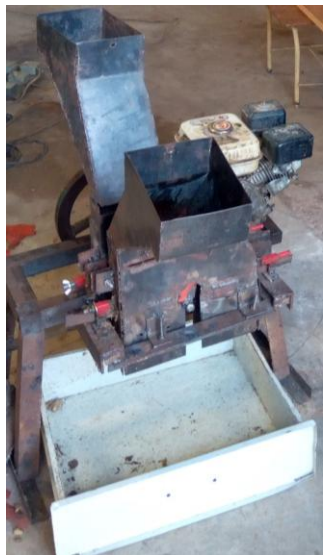
Fig. 2. Operating the dual compartment ginger slicing machine

were collected in a container through the outlet just below the slicing chambers. The collected ginger was separated and weighed to determine the slicing efficiency and percent broken and bruises. The speed of impeller was varied into five levels (250, 300, 350, 400 and 450 rpm). The experiment procedures were repeated into three times. The pictorial view of the dual compartment ginger slicing machine in operation is shown in Figure 2.