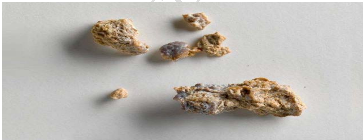
Figure 1. Kidney stones

Urinary stones are solid masses composed of a collection of small crystals (Figure 1) which are formed and present in the urinary tract, due to the agglomeration of some components in the urine under certain physicochemical conditions. Urinary stone disease has a great influence on human health and is a disease with a high likelihood of recurrence (or recurrent at a rate of more than 10% within a year).