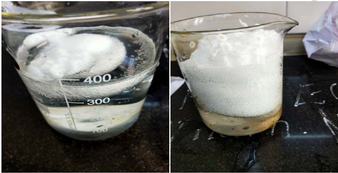
Fig 2 (a) & (b). Process of Decalcification of egg

The semi-permeable membrane was prepared by placing egg in 2M HCl for one night to cause decalcification of egg shell (Figure 2a & 2b). Then the apex of the egg was punctured to squeeze out the entire content and the outer semipermeable membrane was collected (Figure 3). The egg membrane was washed with ammonia followed by distilled water for neutralization of acid traces and stored in refrigerator in Tris buffer maintaining a pH 7-7.4 in the moistened condition (Rohan et. al).