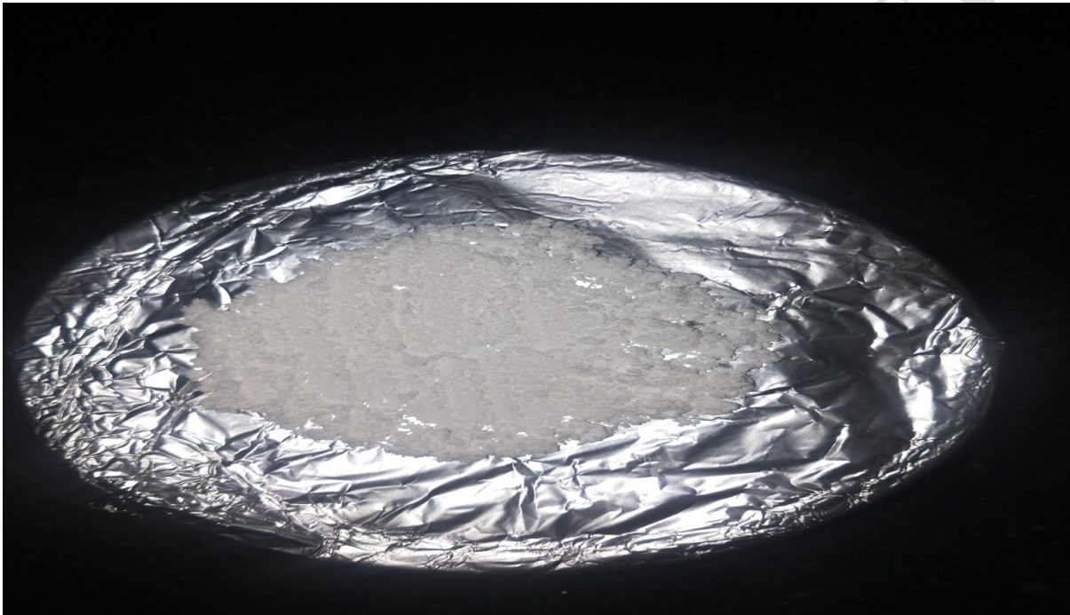
Fig 4. Calcium phosphate crystals

Then the synthesized calcium phosphate stone were punched to tablets (Figure 5) and these tablets were considered as stones in the study.