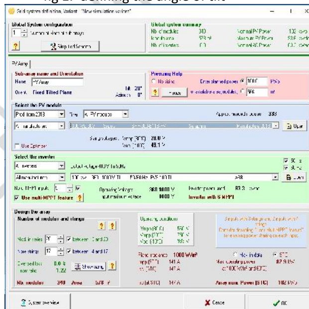
fig 2. system parameters definition in the software