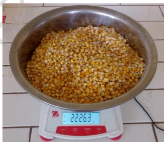
83 Fig. 3. Variety of corn coded F8128 used for experimentation