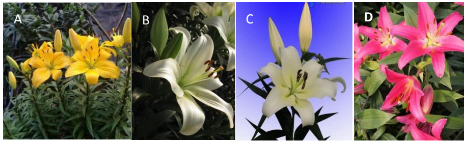
Fig1 : A: A 'Val di Sole' B: LA 'Adoration' C: OT 'Ice Cube' D: O' 'Zantriana'

Enzyme-linked immunosorbent assay kits for lily symptomless virus (LSV) and cucumber mosaic virus (CMV) are products of American ADGEN company, TransZol PlantRNA extraction kit (TransGen Biotech), RNase-free Water, isopropanol, chloroform, absolute ethanol and RT-PCR reverse transcription kit (TransGen Biotech).