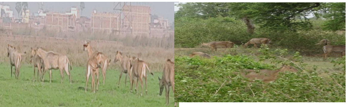
a. Nilgai in urban areas near Patna

is probably the first to have been modified during domestication. In the changing scenario of demographic and ecological niche regarding present stress situation, its (Nilgai) behavior has also been changed and it started moving for food near human habitation during dusk period and feed along the night and returning come back early morning to the dwelling same space [23].