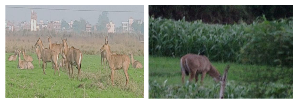
Nilgai siting & standing in pulses Crop d. Veal Nilgai grazing cultivated grass c.