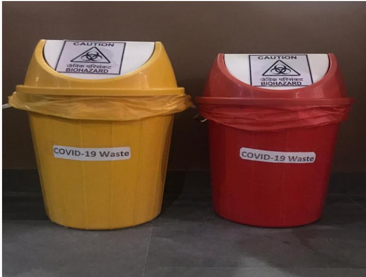
Figure 2: Red and Yellow bins in Hospitals for COVID-19 Biomedical Waste.

(iii) The quarantine facilities and during home care for suspected COVID-19 patients, the guidelines noted that even though a low quantity of biomedical waste is expected to be generated, they still need to follow strict steps to ensure safe handling and disposal of waste. The general waste with no contamination to be disposed according to SWM Rules, 2016 and the contaminated or infectious waste to be given to CBWTFs in yellow bags for treatment and proper disposal. They can report ULBs in case any difficulty in disposing waste.